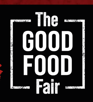
EXHIBIT AT NORDIC REGION'S NUMBER ONE TRADE FAIR FOR NATURAL & ORGANIC PRODUCTS